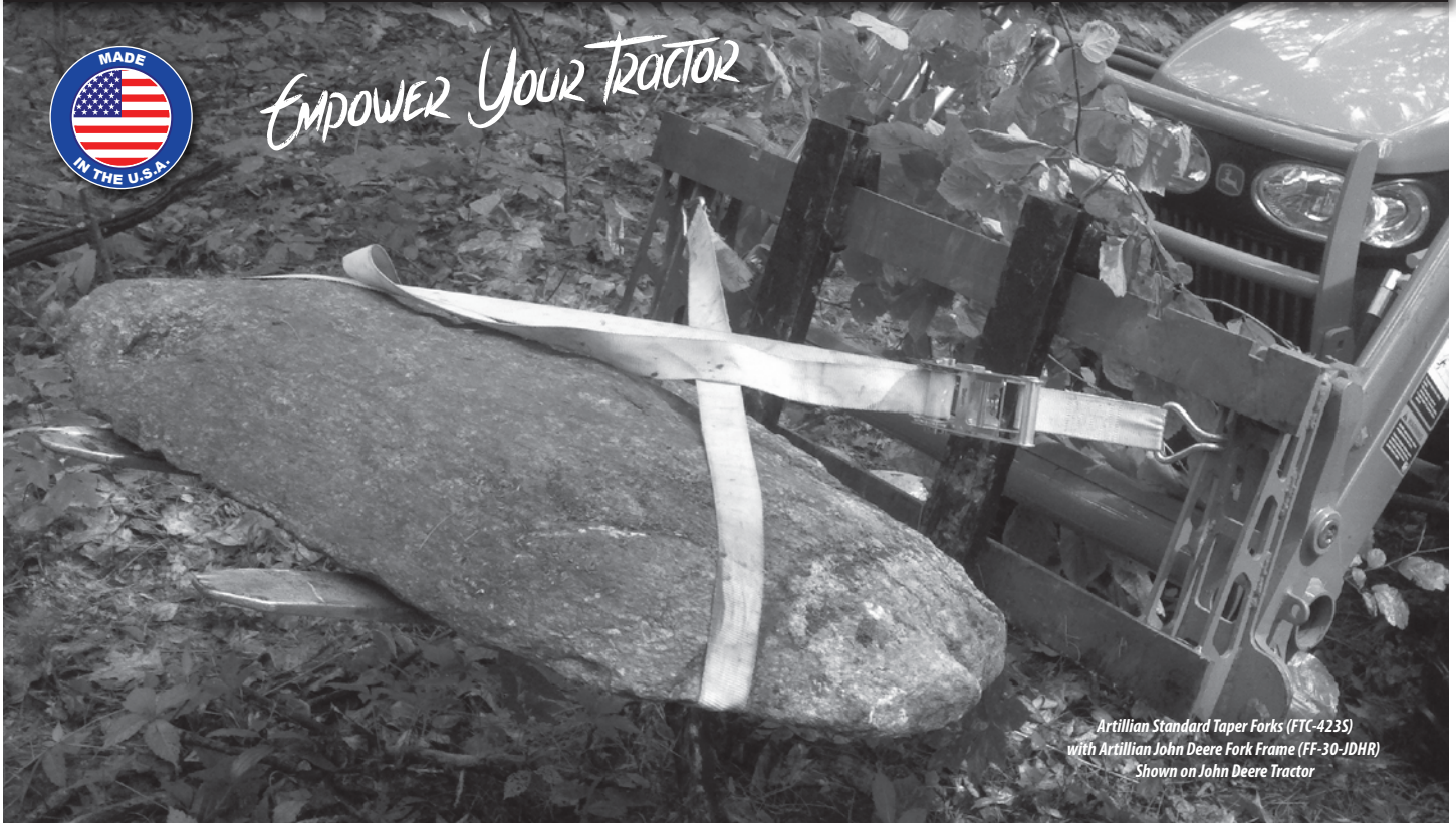
Artillian Standard Taper Forks (FTC-423S) with Artillian John Deere Fork Frame (FF-30-JDHR) Shown on John Deere Tractor

Compatible with John Deere and Skid Steer Quick Attach Loaders (Kubota, Mahindra, Massey Ferguson & Yanmar)